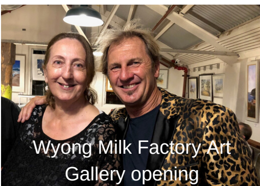
Wyong Milk Factory Art Gallery opening