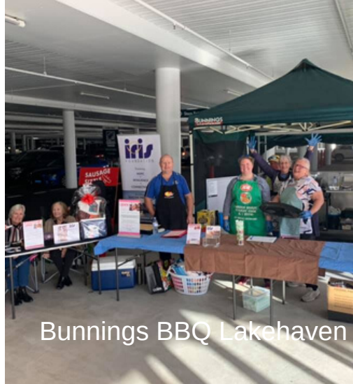
Bunnings BBQ Lakehaven