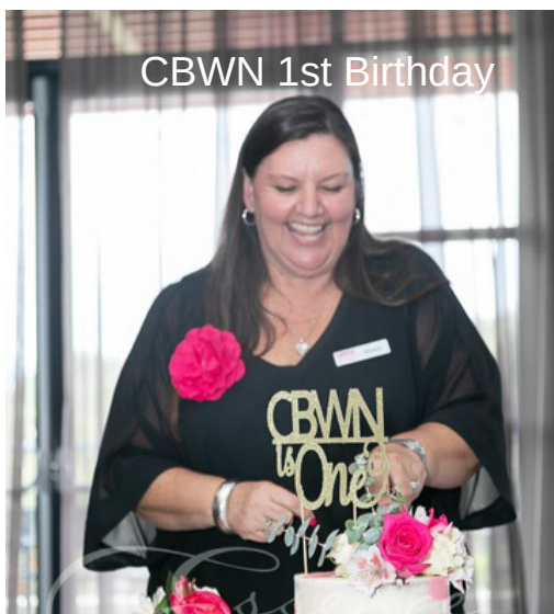
CBWN 1st Birthday