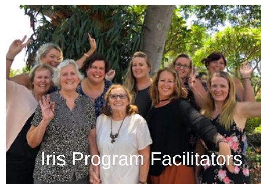
Iris Program Facilitators