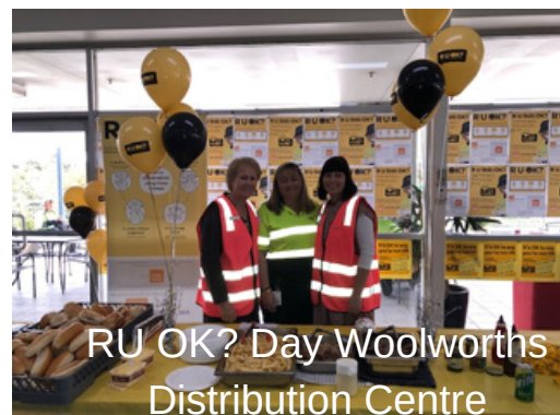
RU OK? Day Woolworths Distribution Centre