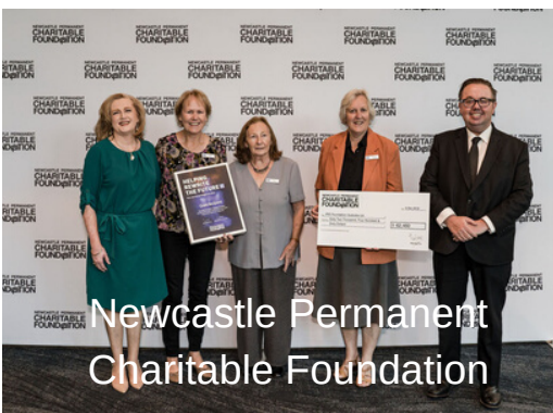
Newcastle Permanent Charitable Foundation