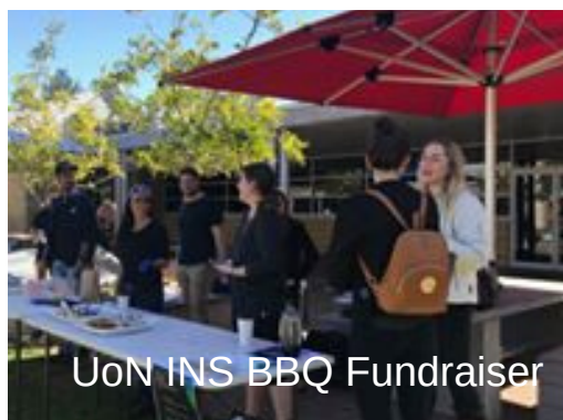
UoN INS BBQ Fundraiser