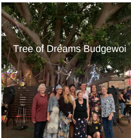
Tree of Dreams Budgewoi