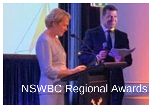
NSWBC Regional Awards