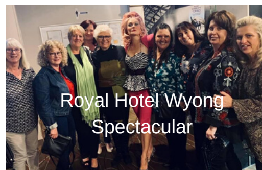
Royal Hotel Wyong Spectacular