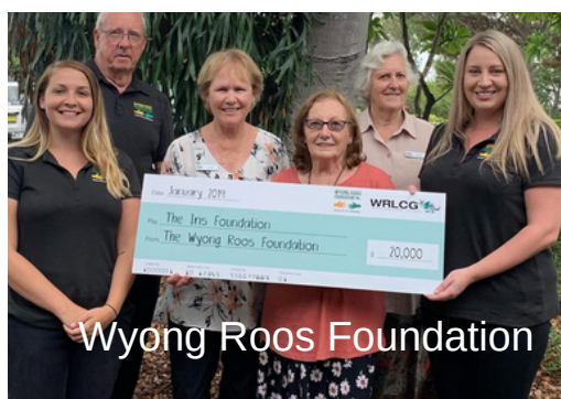
Wyong Roos Foundation