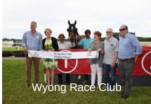
Wyong Race Club