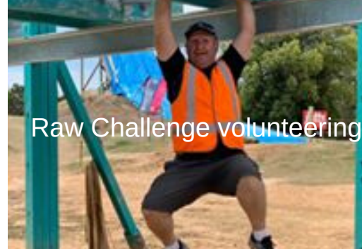
Raw Challenge volunteering