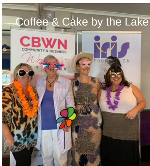
Coffee & Cake by the Lake