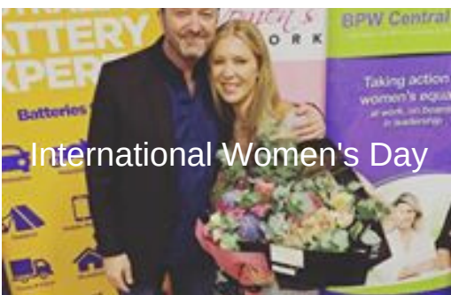
International Women's Day